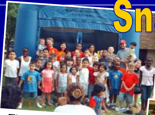
The bouncy house at a summer carnival