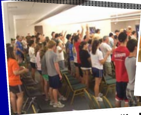
Mission groups at "In His Name" Training Center