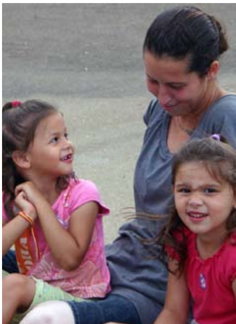
The two children pictured to the left were taught through Rainbow Express this Summer.

Please take the barcode below to your nearest Kroger store in order to re-link. Thank you so much for your wonderful and precious support.