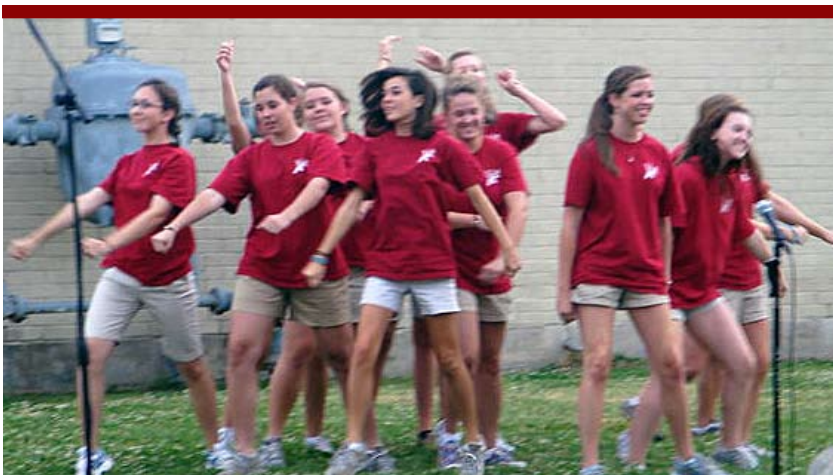
Students from Calvary Baptist Church, Tuscaloosa, Alabama, performing for children and youth in our community. An average of 400 students each week from across the country come to help Mission Arlington/Mission Metroplex during the summer.